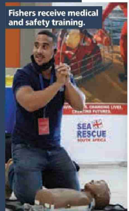
Fishers receive medical and safety training.

The Oceana Maritime Academy is the only sector-specific training facility in the country. In addition to spending R4-million to transform an old fishmeal plant in Hout Bay into a bespoke training hub, Oceana is investing a further R35-million a year to deliver 18 courses, including skills at sea, safety, leadership and business development. "The Co-operative Sense courses will be delivered from there, supporting 2 000 small-scale fishers in the Western Cape, in addition to those who participate in the national outreach programme," says Velleman. "The small-scale fishing co-operatives provide employment and food security, often in communities where both are scarce. They are the bedrock of the fishing sector, and supporting them benefits their communities, the industry and ultimately the country."