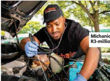
Michanic has created over 45 job opportunities, paying out more than R3-million to date to its mechanic network and impacting over 250 lives.